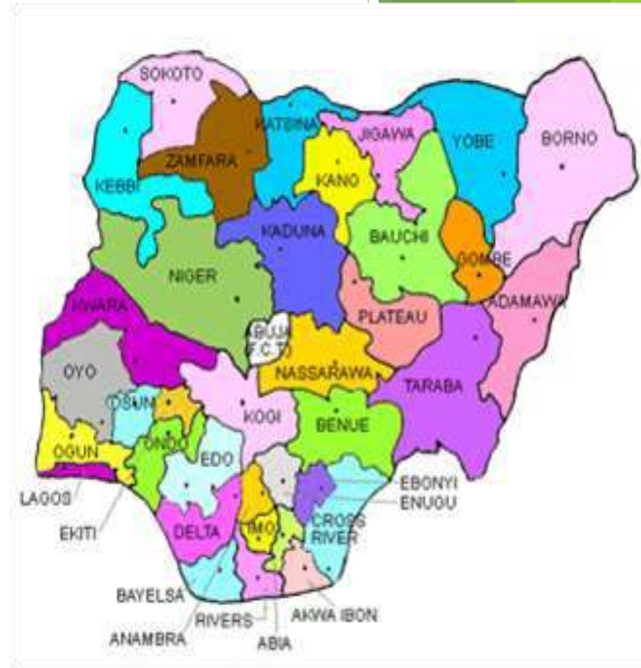
Map of Nigeria